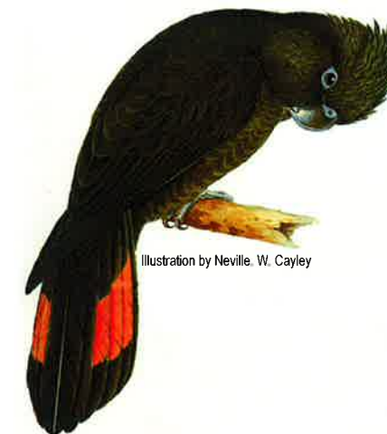
Illustration by Neville. W. Cayley

A 5 km loop walk featuring 3 lookouts, a narrow gorge, many caves and lots of interesting plants. Allow 2 to 4 hours